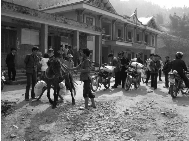
Figure 2. A state agricultural distribution centre, Bắc Hà district, Lào Cai province, Vietnam

farmers come to these neighbours to buy or barter small quantities of this customary production when they need it, especially for ritual purposes. In short, these Hmong farmers do not merely compute the lucrativeness of their choice; their equation also includes cultural preference.