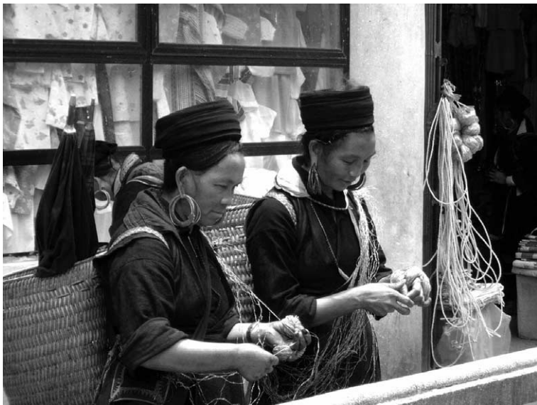
Figure 3. Hmong (Mong Leng) women processing hemp fibre while at the market, Sa Pa town, Lào Cai province

In the third example, by the mid-1990s, most Hmong in Lào Cai province still used pack horses to take their goods to and from marketplaces and between villages. Today, horses are rare, all but replaced by motorcycles. The Hmong who can afford them use